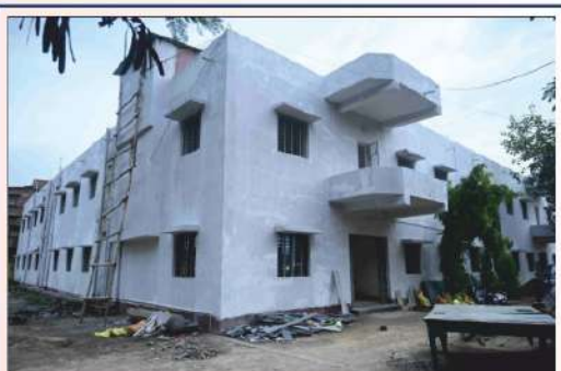
Kalpana Chawla Girls Hostel