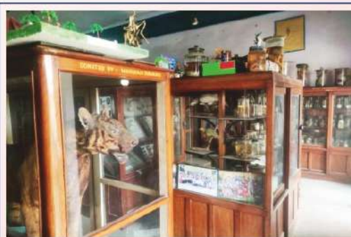
Zoology Specimen Area