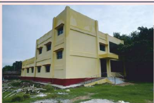
College New Building